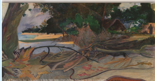
Te burao (El árbol de Hibiscus) 1892 Paul Gauguin Francés, 1848-1903 Instituto de Arte de Chicago