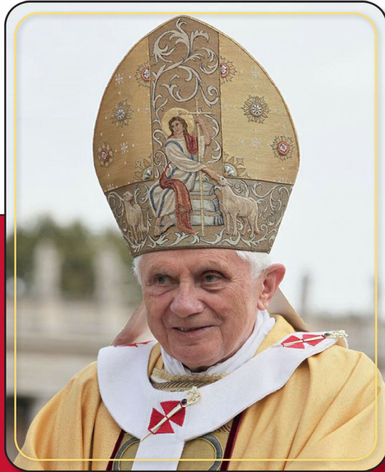
PAPA EMÉRITO BENEDICTO XVI 16 DE ABRIL DE 1927 – 31 DE DICIEMBRE DE 2022